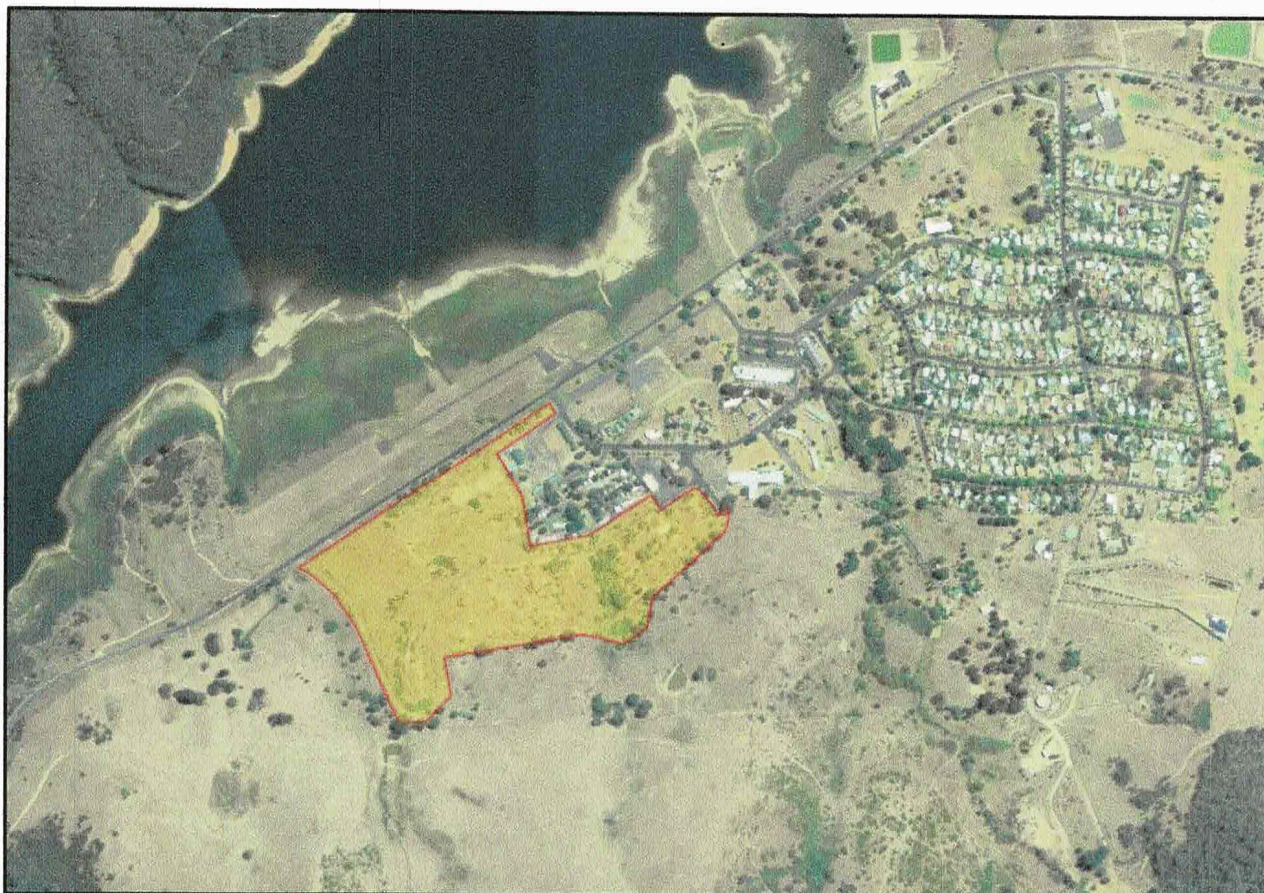
Figure 2: Proposed site master plan.