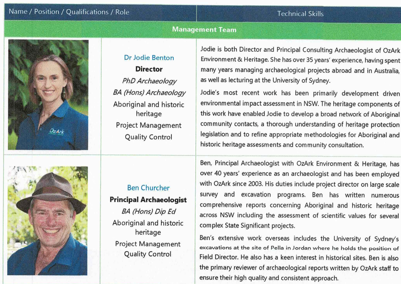
Table 3-1. OzArk technical skills. Relevant experience.